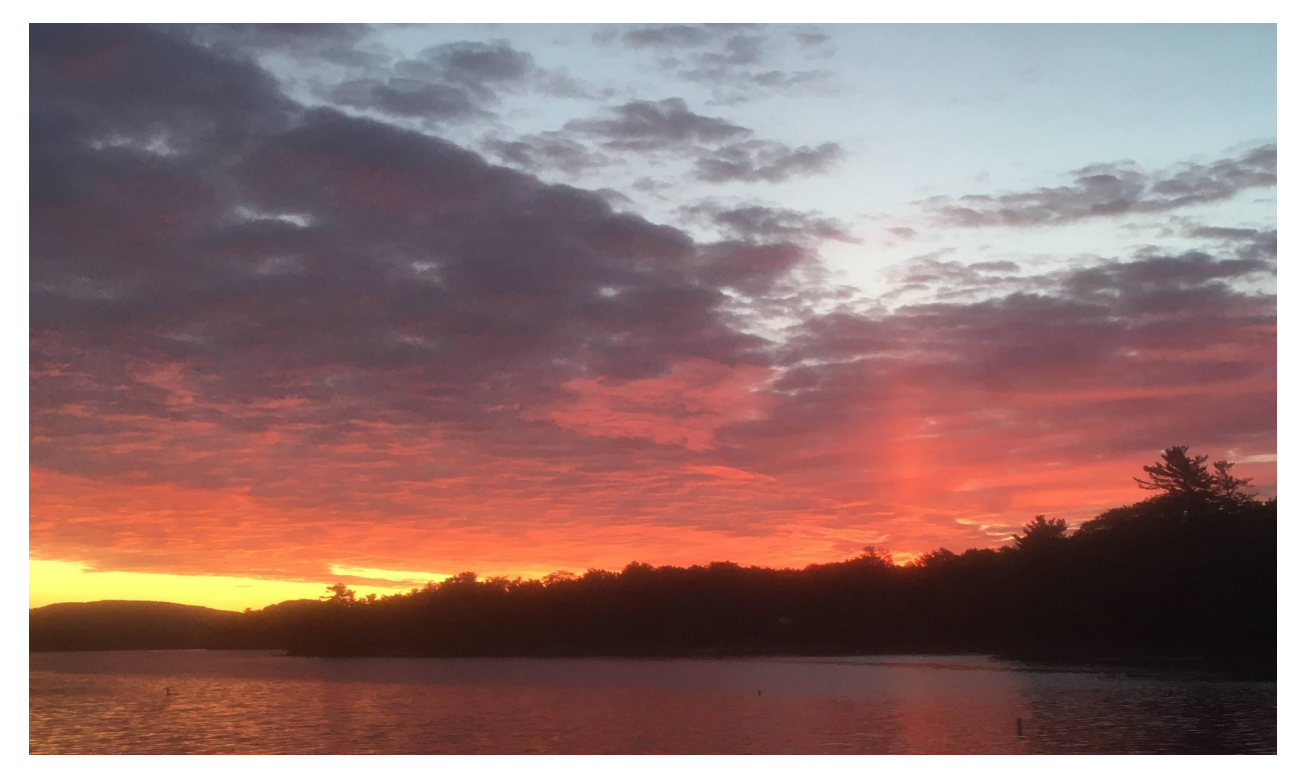
Sunrise over East Road, Long Point