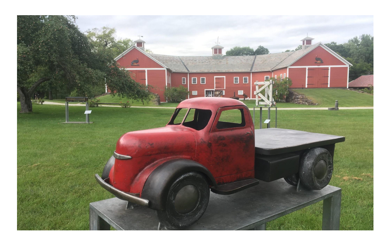
BYO pickup truck to the clean up day! But perhaps a little bigger than this one at Shelburne Museum. Asa D. Hall '46 Studebaker , bronze and aluminum, by Peter Kirkiles.