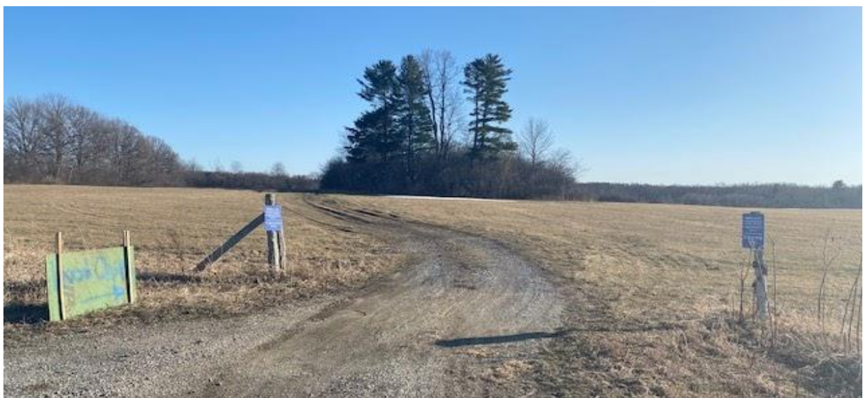
Entrance to the Long Point "Stump Dump" – on the south side of Long Point Road.

Volunteers should meet at the Farmhouse and bring gloves, rakes or pitchforks. If you arrive after 8:00 a.m., go to the Bay Road beach where there will be plenty of action. Residents should pile yard debris next to the road on their property. We will be collecting yard waste, branches and sticks that have washed ashore over the winter and taking them to Long Point's stump dump. We cannot take any lumber or metal debris – nothing man made. If someone has a large pile of debris at their property, try to be there to help load it on one of the trailers. If you have a truck to help move debris to the Stump Dump, please bring it. George Decker will be leading the effort. If you have any questions, call or email George at 703-909-5626 or georgejdecke@gmail.com .