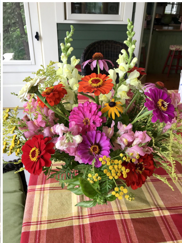
...to table. Flowers and photos by Katy Nunn.