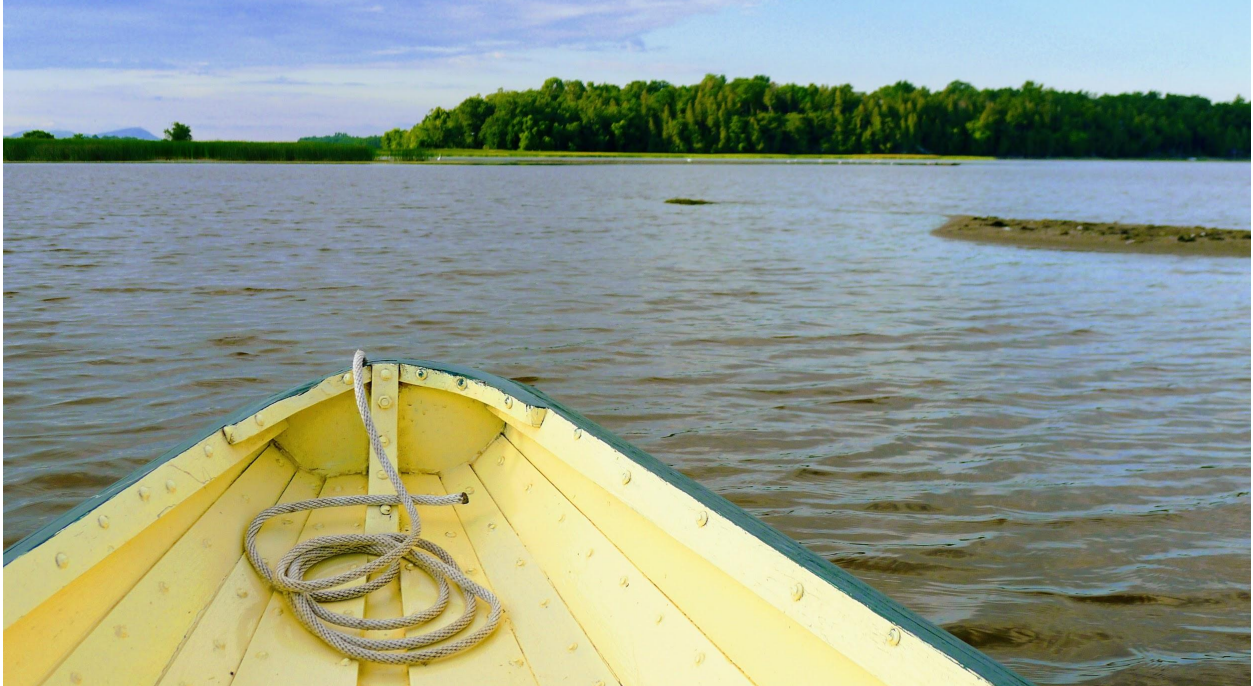
Looking south toward Little Otter Creek.