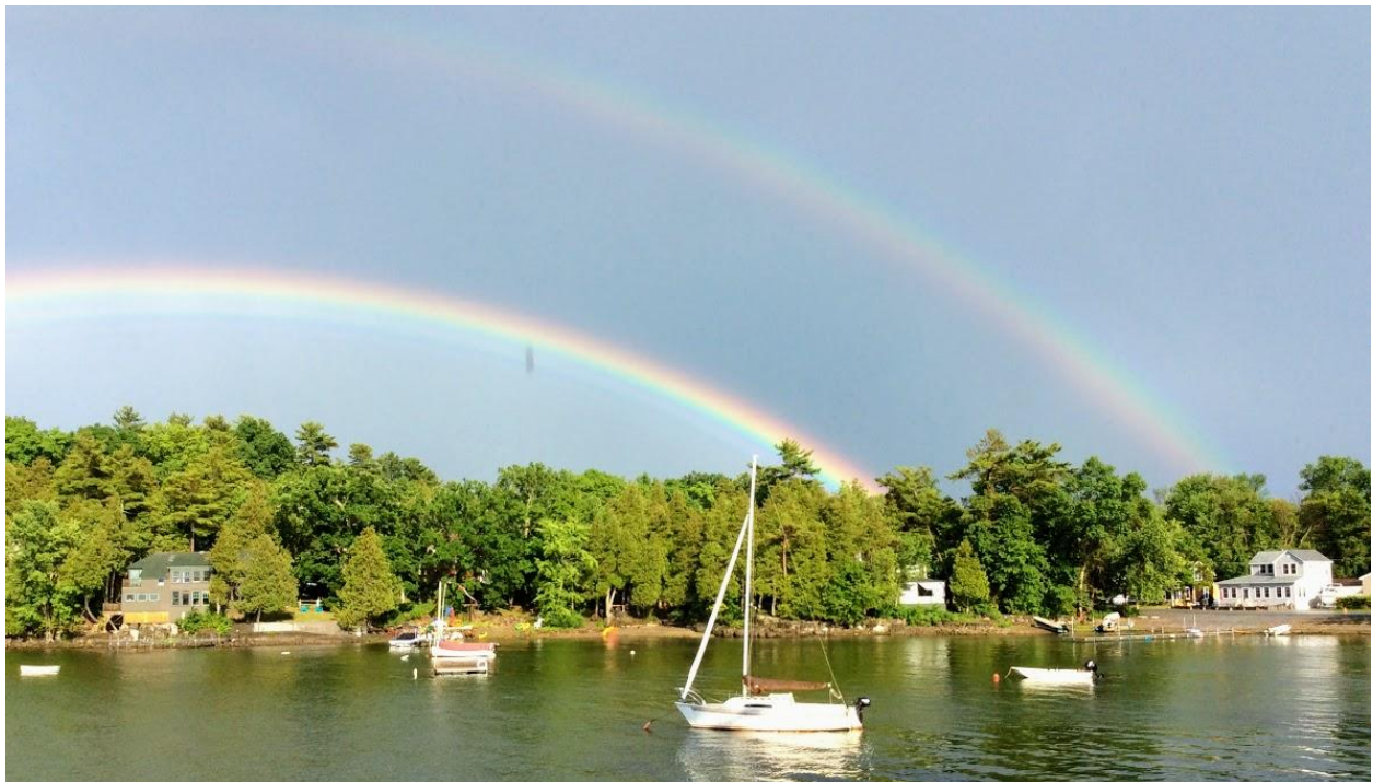
July 20, 2020 double rainbow over the bay.