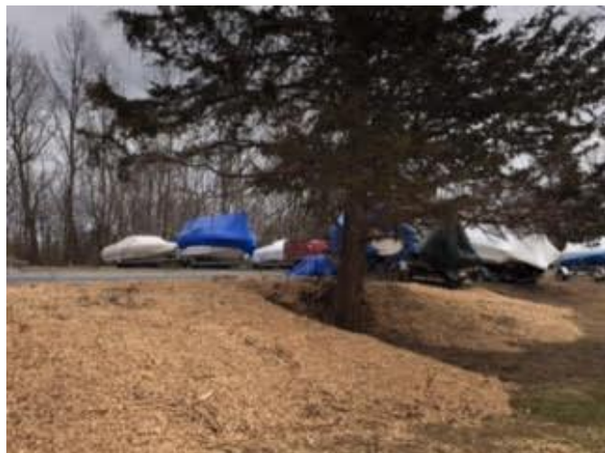
Photos of the March 25 ash tree work and resulting cordwood and mulch.